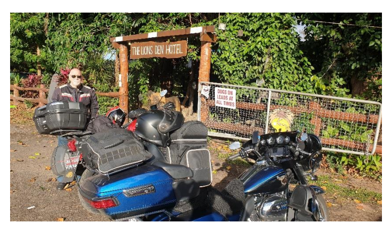
Outside the Lions Den