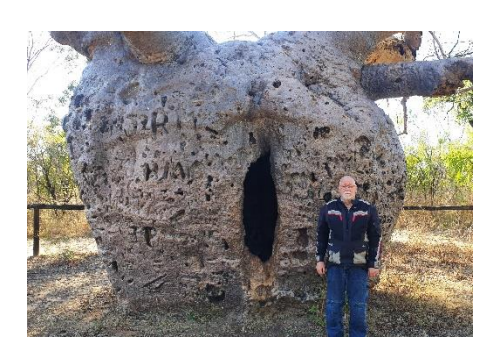
Boab Prison Tree, King River

Nearby was the longest watering trough I've ever seen.