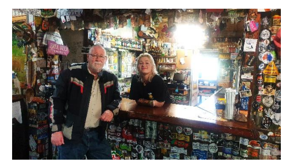
Cute backpacker barmaid

Paul said we had to go to the Lions Den just South of Cooktown. It is an old rustic (tin shed) pub with camping out the back. A photo at the bar with a pint would have been appropriate, but it was 9am and they don't sell alcohol until 10. So, we made do with an egg & bacon sandwich. The place was littered with posh SUVs.