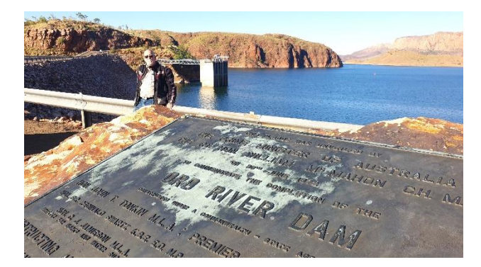
Ord River Dam

We went in for a look at Lake Argyle, which I'd read about, but never seen. Huge. And lots of water going through the spillway. What a shame it isn't closer to a large town.