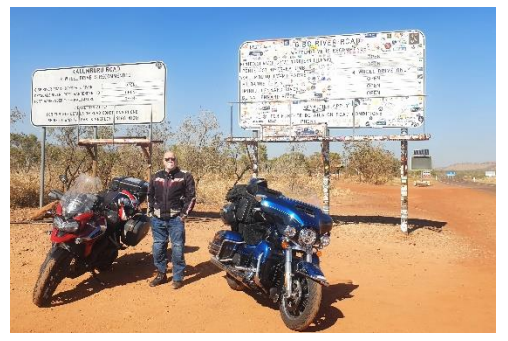
Gibb River Road