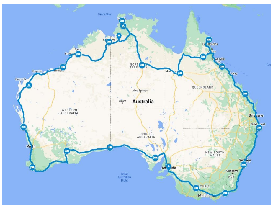
A Google map of our journey is at

https://www.google.com/maps/d/u/0/edit?mid=1B5gVXy3728LGxymnfkcb6mM0VGV6rWk&usp=sharing