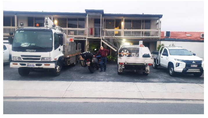
At Ballina surrounded by workers