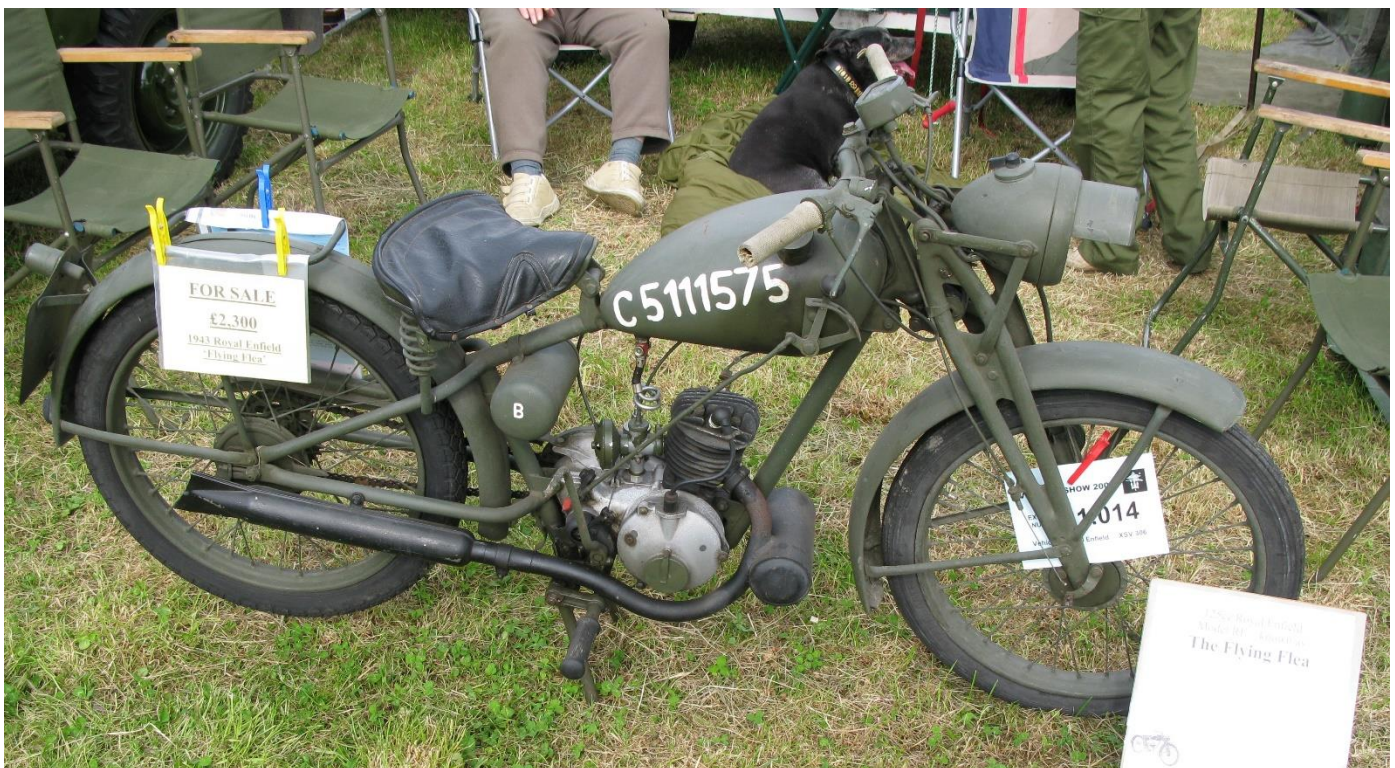
*Story and images from Wikipedia

Royal Enfield also produced a civilian version of the bike in the post war years, the RE125, through 1950, when a foot-operated gear change lever was added and the front forks were modified to a telescopic style with internal spring dampening. In 1951 the RE2 was introduced with a redesigned frame and engine. The line ended in 1953 with the introduction of the Royal Enfield Ensign.