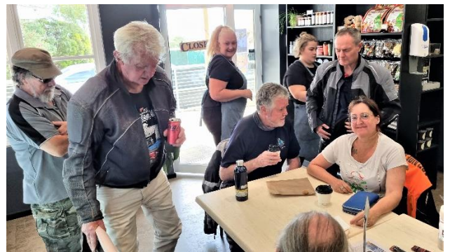
Wistow for morning tea