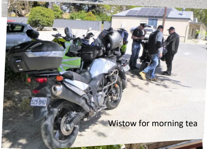
Wistow for morning tea